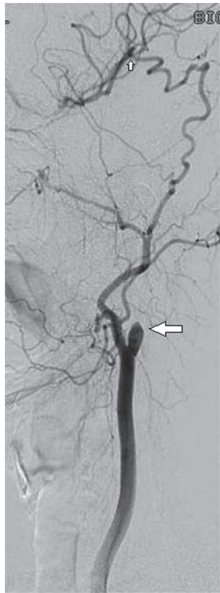
Fig. 2 Superficial temporal artery (STA) and middle cerebral artery (MCA). Remark to occlusion of internal cervical carotid (big arrow) and swallow of MCA by anastomosis (small arrow).

The EC-IC bypass procedure may be a valid alternative in intracranial arterial stenosis. The findings of the SAMMPRIS trial support that aggressive medical management should be used rather than angioplasty in patients with intracranial arterial stenosis. 16 The occurrence of any stroke and major hemorrhage was higher in the percutaneous angioplasty group than in the medical group. Therefore, one may consider EC-IC bypass to treat intracranial arterial stenosis. In our series, we performed EC-IC bypass surgery on two patients with severe symptomatic stenosis in the MCA segment with good outcome.