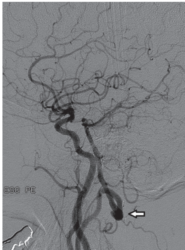
Fig. 3 Anastomosis of occipital artery with extracranial horizontal segment of vertebral artery (arrow). Remark to swallow of system vertebral basilar by anastomosis.

intracranial aneurysms. Following that indication, we performed the bypass in two cases of giant aneurysm in the cavernous internal CA as part of the strategy of cervical internal CA occlusion to manage the aneurysm. The same rationale supported the indication of bypass for posterior circulation in the case of a giant aneurysm in the middle one-third of the basilar artery. We did a bypass of the occipital artery to the AICA at the cerebellopontine angle. In a second stage, the basilar artery upstream of the anastomosis was occluded using endovascular technique.