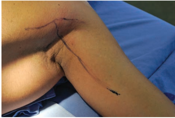
Fig. 1 Incision in the arm.