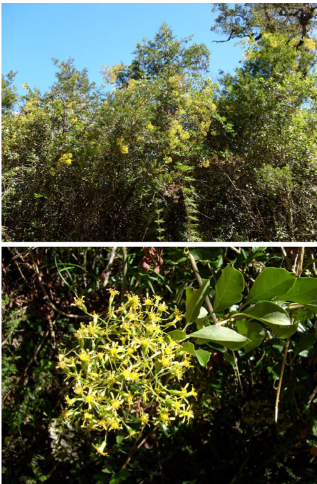
Fig. 1 Photos of the P. desiderabilis (Vell.) Cuatrec. studied specimen

Neglected protozoan diseases such as malaria, Leishmaniasis, and Chagas disease affect millions of people worldwide, with high morbidity and mortality. Cross-sectional studies in the 1980s indicated that the prevalence of T. cruzi in the 18 disease-endemic countries of Latin America was 4.72% (16–18 million) of the population, with an incidence of 700,000–800,000 new cases per year and approximately 45,000 deaths per year due to cardiac disease (Tempone et al. 2007). Presently, the available drugs to treat Chagas disease produce toxic side effects. The nitroheterocycles nifurtimox and benznidazole, the only two drugs used in the early stages of American trypanosomiasis owe their action to the reduction of a nitro group corresponding to an anion radical. This also appears