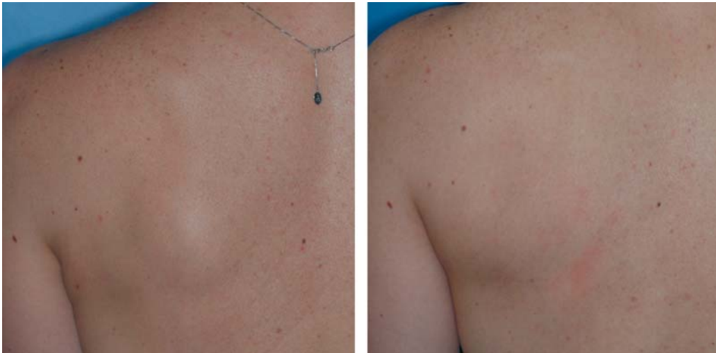
Figure 5: Before laserlipolysis + aspiration of scapular giant lipoma and after two sessions, illustrating the excellent aesthetic result and imperceptible scar six months after the procedure

outcome and an absence of damage in the peripheral nerves. 36