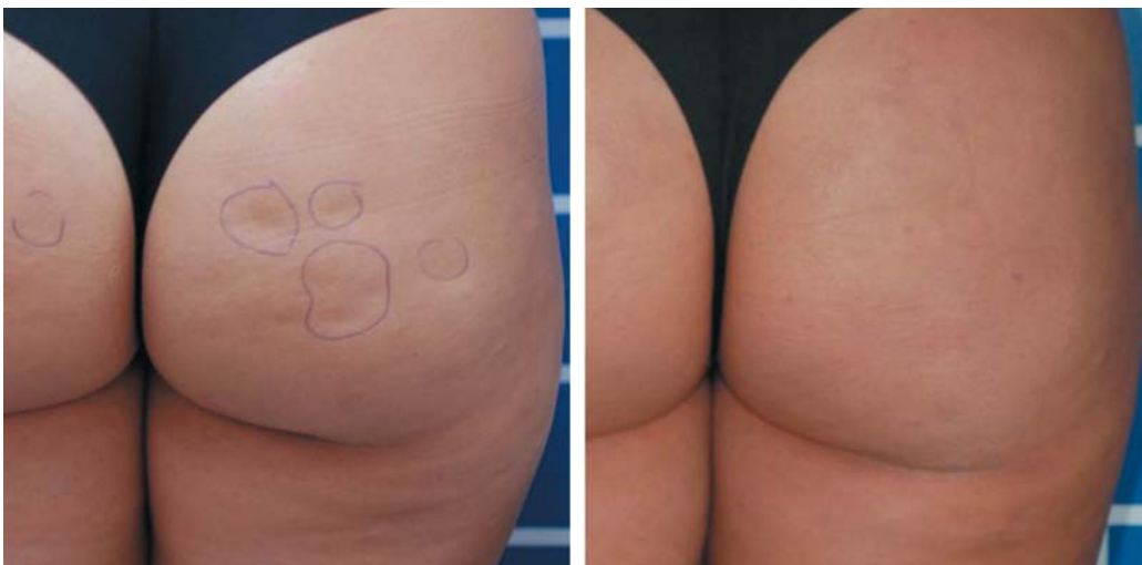
Figure 6: Before and three months after laser lipolysis for the treatment of cellulite

The best results are obtained in small and compact areas. Good results were also obtained in the correction of irregulari-