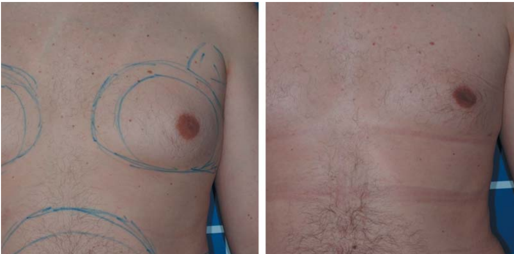
Figure 4: Before laser lipolysis + aspiration to treat gynecomastia and one month after the procedure

reported the subdermal use of 1,064 nm Nd:YAG laser in 17 osmidrosis cases for ablating sweat glands. Twelve patients were monitored six months after the procedure, with good to moderate responses in all cases. Treatment areas were divided into 2 cm squares, each of which received 200–300 J of accumulated energy. 32