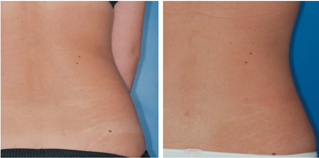
Figure 3: Before laser lipolysis + aspiration in the waist and three months after the procedure (924/975 nm diode laser, 20W/20 W fluence, and 30,000 J of total accumulated energy)