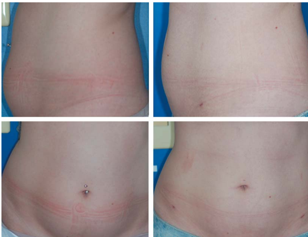
Figure 2: Before laser lipolysis + aspiration in the abdomen and waist with 924/975 nm diode laser (above: profile view, below: frontal view) and one month after the procedure (20W/20 W fluence, and 40,000 J of total accumulated energy)

The number of reports describing laser lipolysis in the treatment of axillary hyperhidrosis or osmidrosis has been increasing in the last few years. In 2006, Ichikawa and colleagues