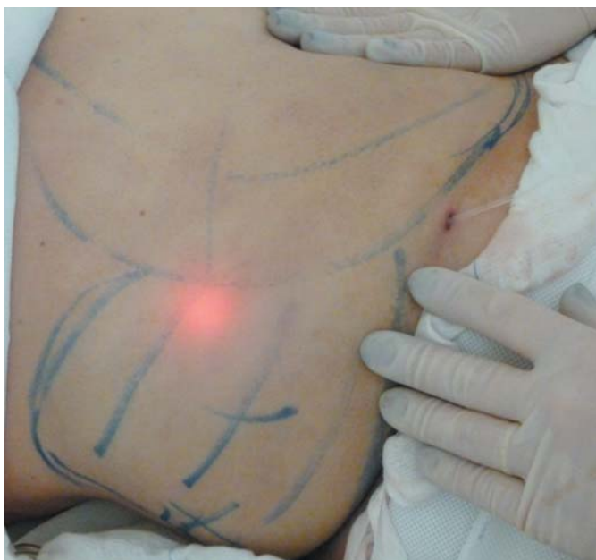
Figure 1: Laser lipolysis in the lateral abdominal region. Note the light emitted by the laser handpiece's tip serving as a guide in the site of application

In 2010, Wassmer and colleagues compared lasers with different wavelengths (920 nm, 980 nm, 1,064 nm, 1,320 nm, and