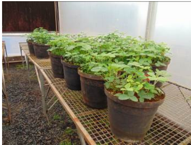
Figure 1. Populations of Heterodera glycines originated from field soil samples, being multiplied and preserved under greenhouse conditions.

A soil aliquot of 150 cm 3 was obtained 28 days after sowing and then processed by the centrifugal flotation in sucrose solution technique, according Jenkins (1964).