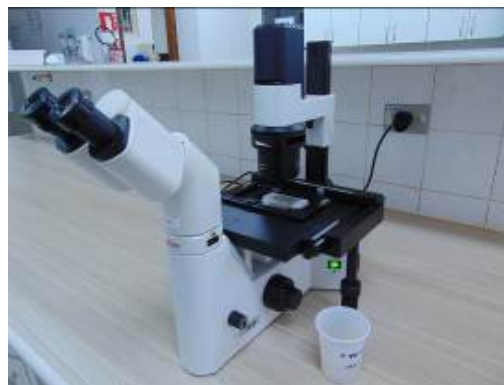
Figure 2. Counting of nematodes in suspension solution with the aid of a Peters' chamber under an inverted light microscope to observe bacterial endospores.

presence or absence of endospores of the bacterium attached to the nematode's cuticle (Figure 2). Subsequently, the percentage of nematodes showing bacteria attached to its body in relation to the total number of nematodes observed in the suspension was calculated.