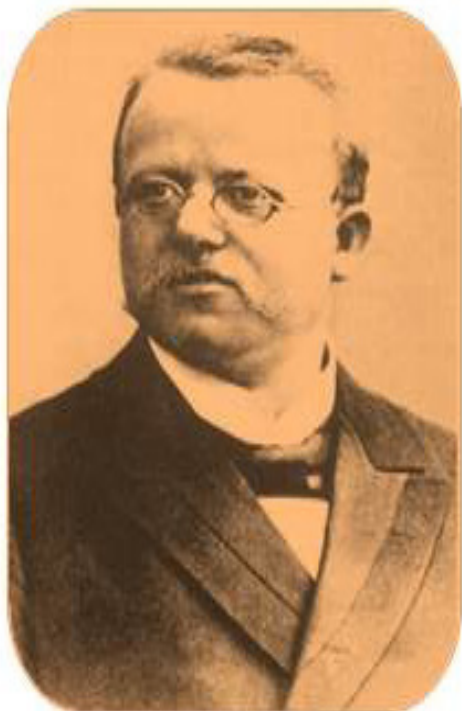
Figure 1. Hermann Oppenheim (January 1 st , 1858, Warburg- May 5 th , 1919, Berlin).

In the meantime, there were still a wide-ranging number of diseases and syndromes not yet identified that were prone to this by a perspicacious and tenacious researcher, such as the Jewish German neurologist Hermann Oppenheim (1858–1919) (figure 1).