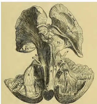
Figure 1. Meynert's "real dissection" of the human diencephalon, brainstem and cerebellum (basal view) (Figure 22, p 47): Pd=peduncular foot, Tm=temporal radiation of the "fan-shaped bundle originated from the temporal and occipital lobes" (or Türck's bundle) 2 .

Advanced neuroimaging with diffusion tensor and tractography has permitted virtual dissection of white matter tracts, including cerebellar ones, in vivo 3 . The first studies of the bases for this technique appeared in 1992, and virtual dissection was implemented in the following years 4 . A tractographic study of Türck's bundle is here presented (Figure 2).