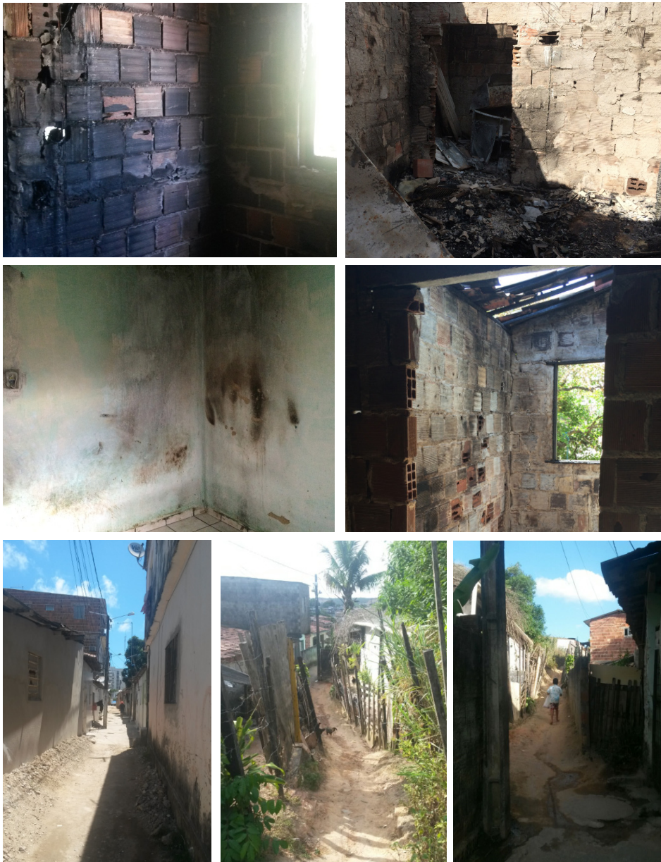
Figure 1 – Damage caused in the structural masonry of some houses due to fire and some access way to sites where fires happened

Masonry buildings have walls with structural and divisive function in the environments (structural masonry, resistant masonry). In the MRR, masonry buildings are mostly made of ceramic bricks, according to Figure 1 .