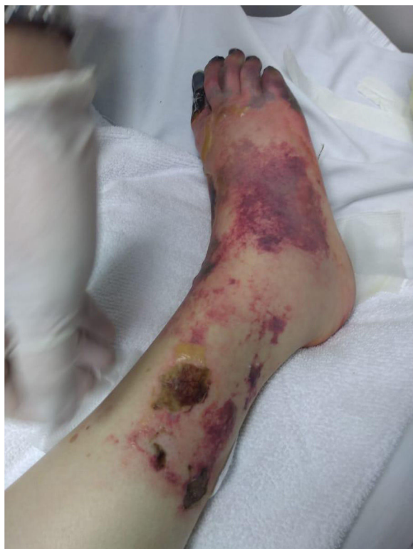
Figure 2 – Ischemic right lower limb with necrotic areas in the toe.

During the recovery period of her organ failures, the patient required surgical procedures including tracheostomy, debridement of necrotic areas in the right foot (Figure 2) and transtibial amputation of the left lower limb. Before those procedures, fondaparinux was ceased for 24 h and 72 h, respectively, and she experienced clinically relevant non major bleeding (CRNMB) with the need of blood products (red blood cells (RBC) and platelet transfusion) and reoperation for hemostasis at the tracheostomy site. Her hemodynamic improvement enabled CRRT to be transitioned to intermittent hemodialysis (IHD) on day 32, and this was accompanied by a slow recovery of the renal function until her last hemodialysis session on day 46 (Figure 1).