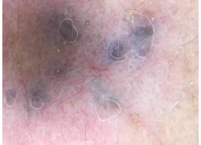
FIGURE 2: Non-polarized light dermoscopy: homogeneous pigmented lesions with a blue-gray hue and absence of structures, interspersed with areas of healthy, slightly erythematous skin with intermingled telangiectasia.

Non-polarized light dermoscopy showed homogeneous pigmented lesions with a blue-gray color and absence of structures, interspersed with areas of healthy, slightly erythematous skin with intermingled telangiectasia (Figure 2). Polarized light dermoscopy showed blue-gray pigmented lesions with areas without structures in addition to bright white lines and smudges with a scar pattern, probably resulting from the scar reorganization typical of the scarring process (Figure 3).