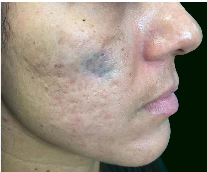
FIGURE 1: Multiple ice picks and box scars in the malar, buccinator, zygomatic, and mandibular region, on the right. Presence of a blue-black macula measuring 4 cm by 3.5 cm in the right buccinator region, with increased pigmentation at the bottom of acne scars.

On dermatological examination, the patient presented multiple icepicks and box acne scars in the malar, buccinator, zygomatic, and mandibular regions, bilaterally. In the right buccinator muscle region, there was a blue-black macula measuring 4 cm by 3.5 cm, with increased pigmentation at the bottom of the acne scars (Figure 1). There were no palpable lymph nodes in the head and neck chains.