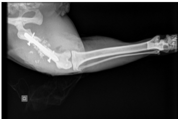
Figure 1. Radiograph taken immediately after surgery showing good bone alignment and the presence of morcellated bone instead of the central fragment

Surgery was performed one day after admission. Intended surgery was placement of a 4.5mm diameter, 80mm interlocking nail, by a Open But Do Not Touch approach. During pin insertion, a further fracture of the central fragment of bone split this fragment into two pieces. The bone fragment was morcellized and used at the site of the defect as a corticocancellous bone graft. The interlocking nail was fixed with 2 screws in each of the distal and proximal fragments, and the incision closed routinely. Radiographs were taken immediately after the procedure to confirm the position of the nail and screws and bone alignment, as seen in Figure 1.